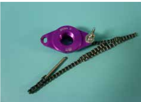
Brina II #EBS1100-0040-STD

A universal adapter for round opening master cylinder reservoir caps. Requires the Master Tool and Hold Down adapter to hold in place on the reservoir.