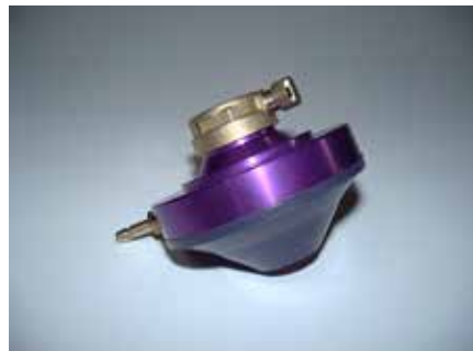
Brina Tool #EBS1100-0030-STD

Provides a variable fitting adapter for round opening master cylinder reservoir caps. Requires the Hold Down Adapter.