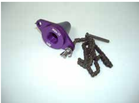
Brina III #EBS 1100-0050-STD

See Brina II above. Can also be used for clutches.