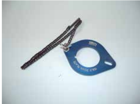
Hold Down #EBS110-0020- STD

Holds adapters that do not have integral connection means.