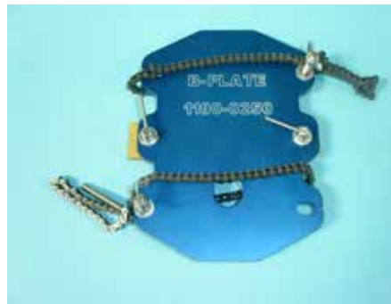
B-Plate #EBS 1100-0250-STD

Covers all large rectangular opening reservoirs. Requires Master Tool