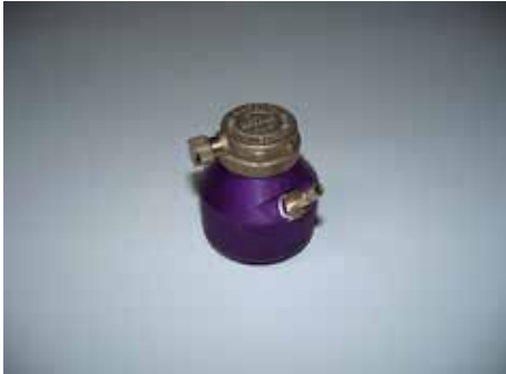
Master Tool # EBS1100-0010 - STD

Attaches to all adapters that do not have vents such as the Brina II. The fill line attaches to the Quick connect plug.