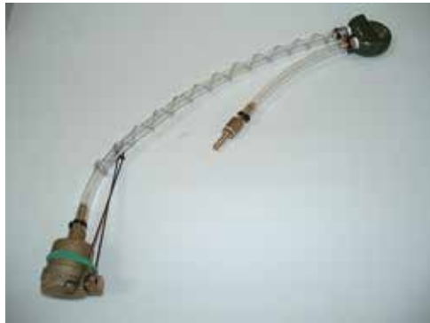
C-Blank #EBS1100-0080 and C-3 #EBS1100-0070-STD

Used on Chrysler vehicles that have screw on master cylinder reservoir caps that are hard to reach unless the cabin shroud is removed. This adapter will fit under the shroud